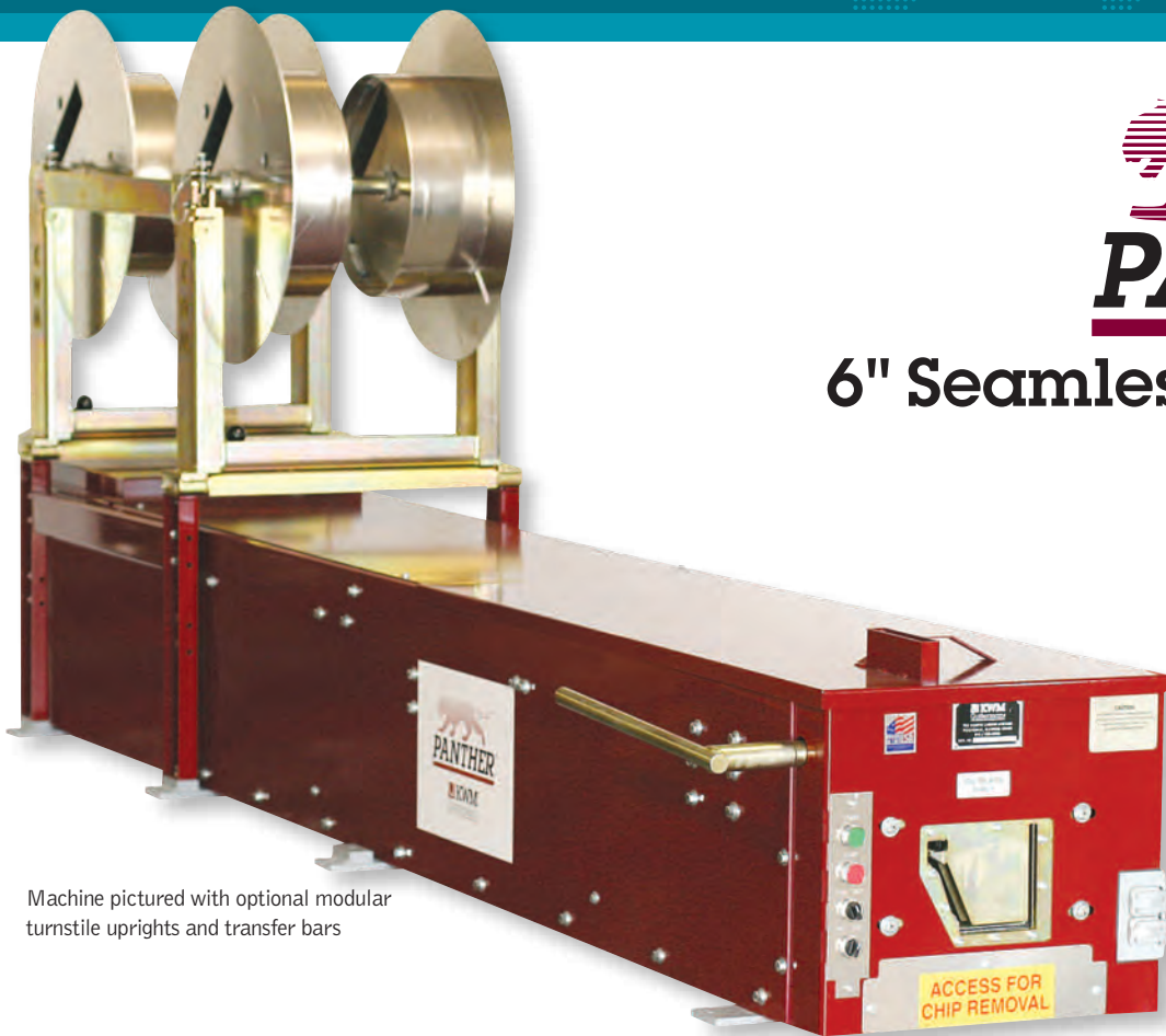
Machine pictured with optional modular turnstile uprights and transfer bars