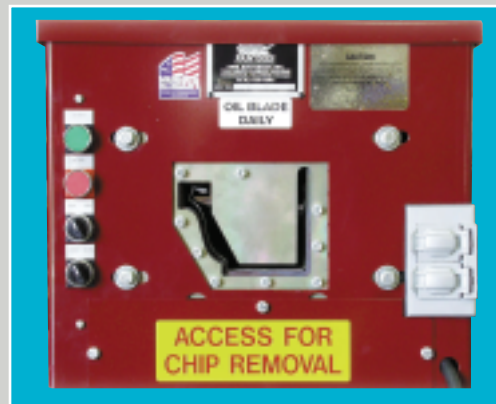
Front pull guillotine